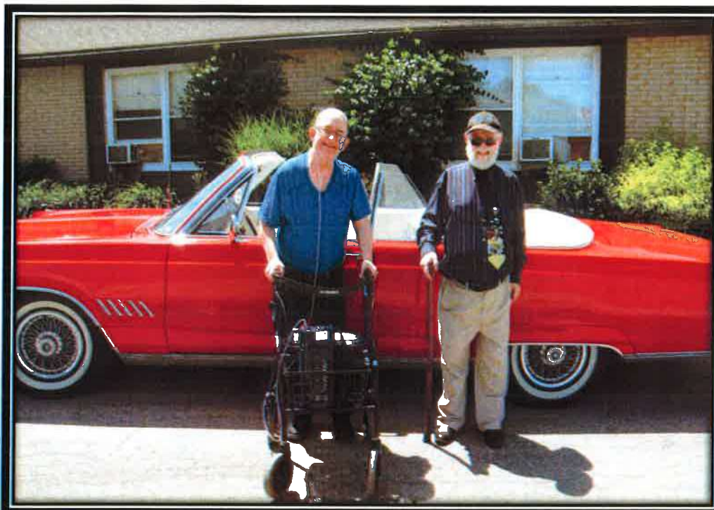
ANNUAL CAR SHOW AT GEORGIAN HEIGHTS