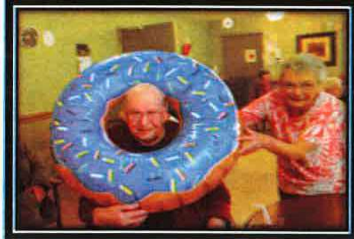
Father's Day Donuts and Dads Social on June 16 th

This is a MUST if you are bringing a furry friend to visit.