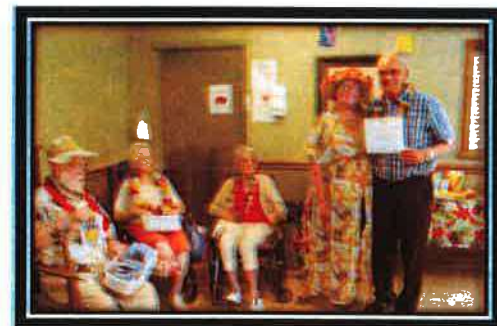
Volunteer Appreciation One of our dedicated volunteers receiving their Certificate at the Beach Theme Appreciation.